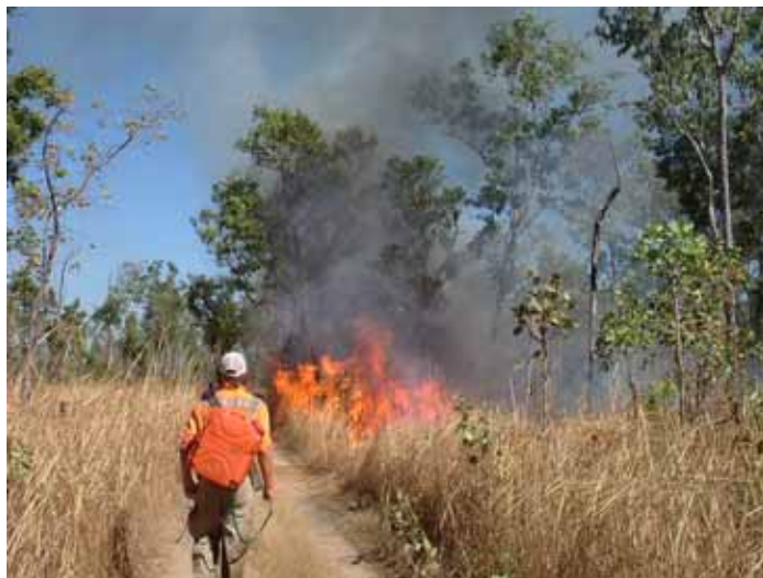
The next level of defence!