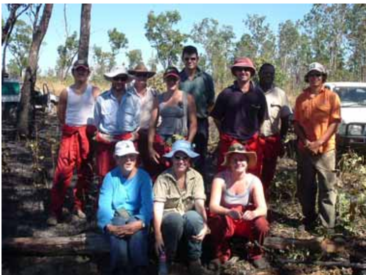
The team still smiling