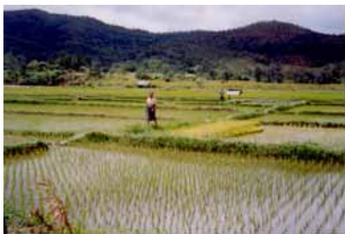
The view from Pousada Maubisse